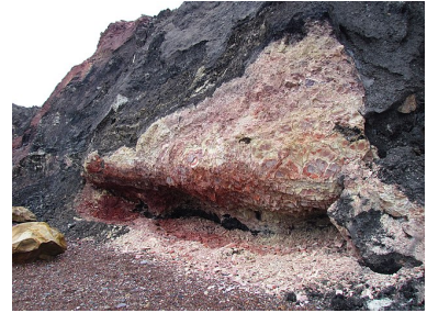
Eroding mud face exposing new minerals.